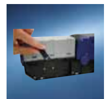
BlueChip™ for convenient updates