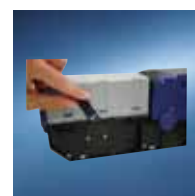
BlueChip™ for convenient updates