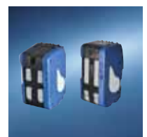
30 and 60-note capacity Recycler Cassette