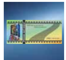
Coupon capability to reward consumers