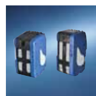
30 and 60-note capacity Recycler Cassette