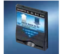
Pulsing Blue LED lights attract consumers